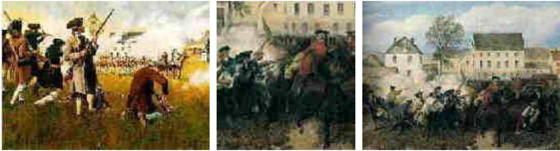
American Militiamen in Battle with Major Pitcairn at Lexington Green

Although it is known that no British soldiers were killed at Lexington Green , Major Pitcairn's horse was shot twice. Some sources say that Pitcairn, who was 52 and portly, fell off and that because of this event his pistols were lost and are now, together with a charming miniature of him, at Hancock-Clarke House, 36 Hancock Street, Lexington Mass. (617-861-0928), as treasured relics of April 19, 1775. Other sources confirm that the horse was wounded at the Battle in Lexington but that on the march back to Lexington, his horse (the same?) , frightened by a sudden volley, threw him off and escaped, obliging him to continue on foot.